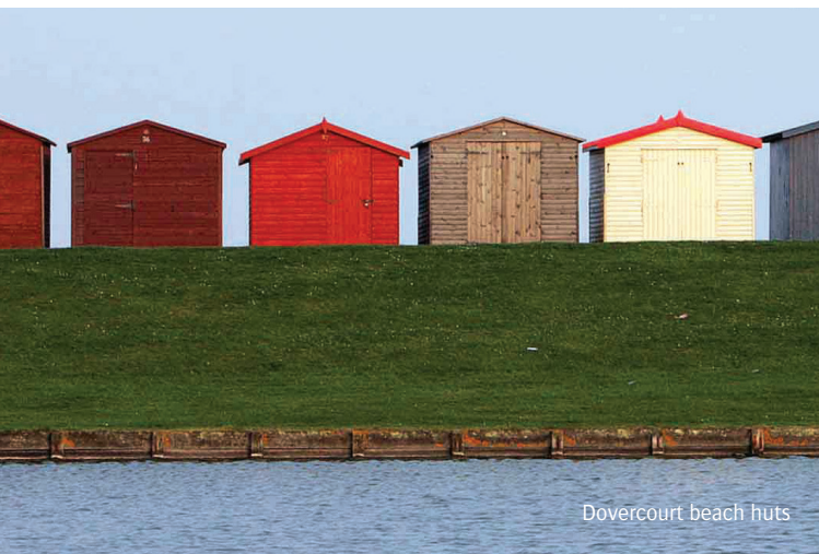
Dovercourt beach huts

The areas nature reserves and bird sanctuaries provide excellent opportunities for bird watchers and wildlife enthusiasts. Bobbit's Hole, Dovercourt, is a small freshwater lake bounded by secondary woodland and is a valuable wildlife pocket attracting a number of bird species, including the Kingfisher.